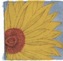
painted sunflower , 2006 etching with chine colle print size: 4 x 4 in. edition of 10 (sold out) 6/06