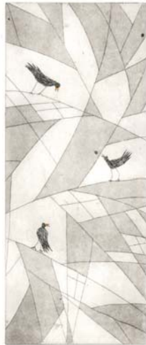
windows and doors, 2008 hand colored aquatint etching print size: 5 x 11 3/4 in. a/p 10/08