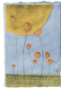
full sun , 2006 etching with chine colle print size: 4 x 6 in. edition of 10 6/06