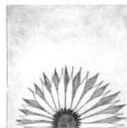
sunrise , 2004 etching print size: 3.875 x 3.875 in. 10/04