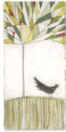
blackbird I , 2007 hand-colored etching print size: 1 7/8 x 4 in. varied edition of 10 7/07

prices may vary depending on matboard, frame size and edition size.