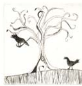
crow talk , 2005 dry point etching print size: 3 x 3 in. edition of 10 11/05