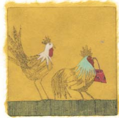
the red purse , 2006 hand-colored etching with chine colle print size: 4 x 4 in. edition of 10 (2 avl.) 6/06

page 4 all copyrights - lisa j. pettit lisa@lisapettitdesigns.com www.lisapettitdesigns.com