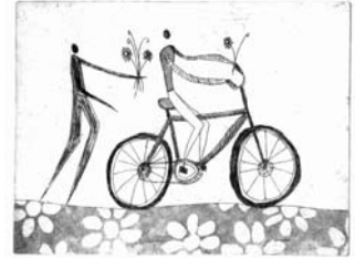
on the same path 2007 aquatint print size: 5 7/8 x 4 1/2 in. edition of 10 10/07