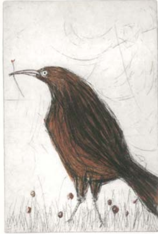
a special flower, 2008 etched monoprint print size: 6 X 9 in. varied edition of 10 1/08

Monoprints - a print is pulled from a plate that already has an image incised into it. Lisa Pettit's monoprints are created by inking an etched plate and painting directly on the plate before printing on the press.