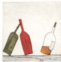
the dancers , 2006 etching with chine colle print size: 3 x 3 in. edition of 10 7/06