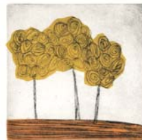
autumn colors , 2006 etching with chine colle print size: 3 x 3 in. edition of 10 11/06