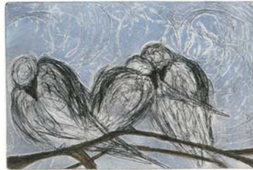
warmth, 2008 etched monoprint print size: 6 X 4 in. varied edition of 10 2/08