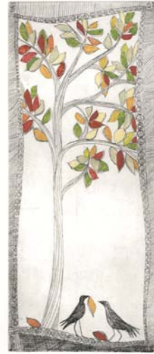
nesting , 2007 hand colored etching print size: 5 x 11 3/4 in. varied edition of 10 12/07