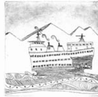
washington state ferry , 2004 zinc plate etching print size: 4 x 4 in. edition of 50 SOLD OUT