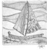
sailboat , 2004 dry point etching print size: 3 x 3 in. edition of 15

page 6 all copyrights - lisa j. pettit lisa@lisapettitdesigns.com / www.lisapettitdesigns.com