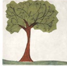
painted tree , 2005 etching with chine colle print size: 4 x 4 in. varied edition of 10 6/05