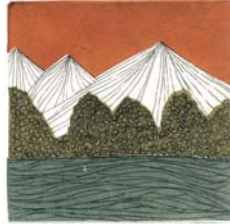
northwest colors , 2005 etching with chine colle print size: 4 x 4 in. edition of 10 7/05 SOLD OUT

page 5 all copyrights - lisa j. petit lisa@lisapetitdesigns.com www.lisapetitdesigns.com