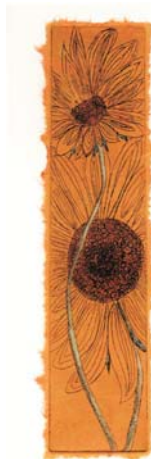
peeping sunflowers , 2005 hand-colored etching with chine colle print size: 2 x 9 in. varied edition of 10 6/05