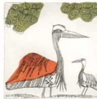
painted herons , 2004 etching with chine colle print size: 4 x 4 in. edition of 5