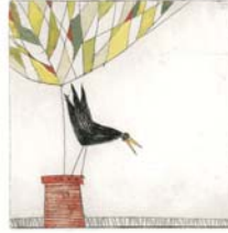
blackbird II , 2007 hand-colored etching print size: 3 x 3 in. varied edition of 10 7/07