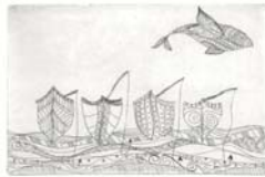
a fish with wings , 2004 zinc plate etching print size: 4 x 6 in. edition of 25