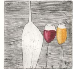
red & white II , 2007 hand-colored etching print size: 4 x 4 in. varied edition of 10 11/07