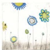
11 flowers , 2007 hand colored etching print size: 3 x 3 in. varied edition of 25 10/07