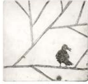
one bird , 2007 etching print size: 3 x 3 in. edition of 10 11/07