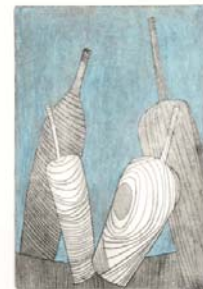
conspiracy of bottles , 2007 hand colored aquatint etching print size: 4 x 6 in. varied edition of 10 12/07