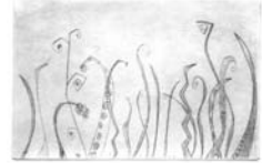
still life , 2004 dry point etching print size: 4.5 x 3 in. edition of 2 SOLD OUT