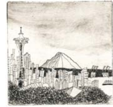
seattle II , 2005 etching print size: 4 x 4 in. edition of 100 7/05