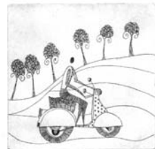
scooter day , 2005 etching print size: 4.5 x 4.5 in. edition of 25 5/05