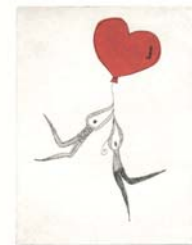
weee... , 2005 etching with chine colle print size: 4.5 x 5.75 in. edition of 25 5/05