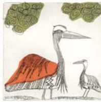
painted herons , 2004 etching with chine colle print size: 4 x 4 in. edition of 5