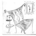
tilted chair , 2004 dry point etching print size: 3 x 3 in. edition of 15