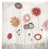
15 flowers , 2007 hand colored etching print size: 3 x 3 in. varied edition of 25 10/07